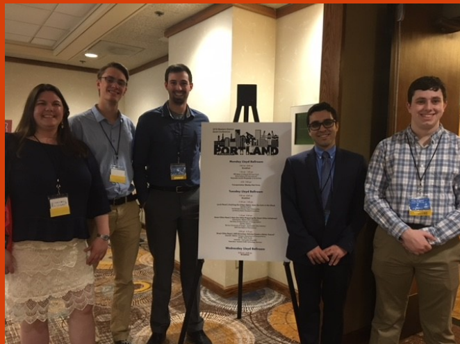
OSU ITE students who attended the Quad Conference.

Our chapter was very thankful to be able to attend and help out at the 2018 ITE Quad Conference in Portland, OR last spring. It was a highly attended conference by many engineers, planners, and more from the area. Topics ranged from technology and autonomy to lighting and multi-model corridors. A highlight for some in our group was the bike tour at the end of the conference, which allowed our members to see real and implemented ideas for bicycle infrastructure. Our group of students included some long-time members as well as some newer ones, not to mention someone that just joined ITE the previous week!