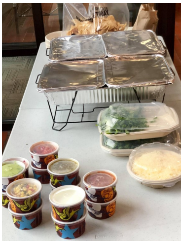
All of our speaker meetings include food—ITE’s treat!