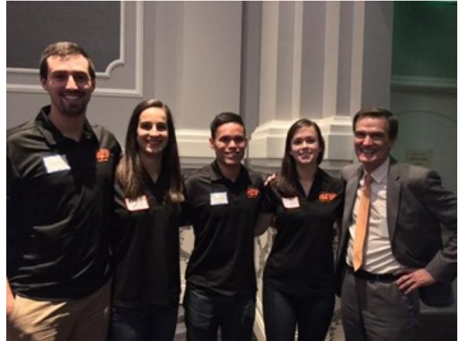
Left: OSU ITE students with engineers at DKS Associates. Right: Traffic Bowl Team at the OR ITE Traffic Bowl.