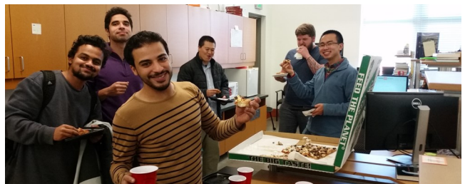
Pizza celebration following midterms

The end of October for many meant that midterms ceased to exist and for others, well, the Chapter wished them good luck. A long enduring week should not go unnoticed and OSU ITE agreed. Several students gathered in the graduate offices to celebrate the completion of midterms, because who can turn down free food? A giant 26” pizza was devoured in a matter of minutes.