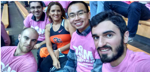
ITE members at OSU Volleyball game

October 23 rd the Women’s Volleyball hosted the No. 1 USC Trojans at Gill Coliseum. Oregon State had a match free of service errors, but still lost in four sets. A small group of ITE members were at the game to cheer on the Beavers. It has become a tradition for the ITE Chapter to regularly attend sporting events on campus, so feel free to come with us!