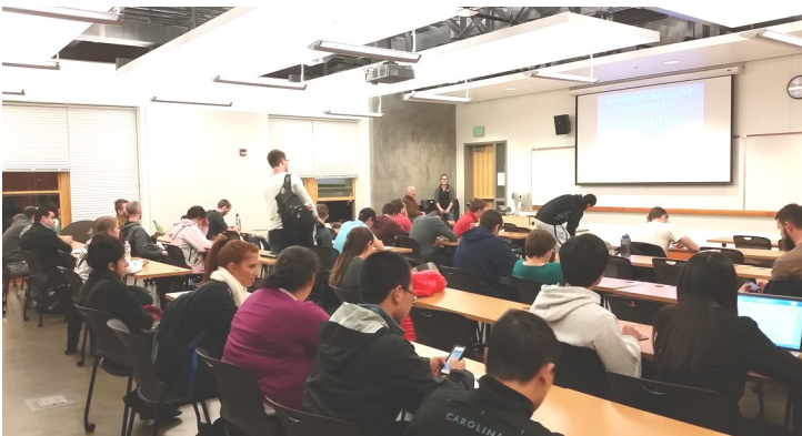
Students gather for a joint meeting from ZRF Architects

As part of this event, the next day members from Oregon ITE gave students a behind the scenes look at several transportation companies in the area. This field trip consisted of visits to Kittleson and Associates, ODOT Region I office, and HDR. Students were exposed to the respective companies' day-to-day operations and given some insights about career paths.