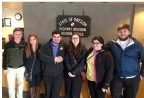
Visiting the ODOT office in downtown Portland

over the summer. While the team remained the same, the strategy did not. OSU battled with University of Washington and Oregon Tech in the second round. The team was two questions away from