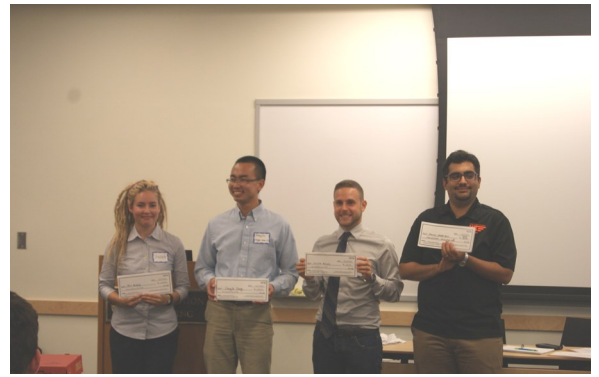
Poster design winners at Student Conference

region for Uber and gave insights on how the company insures driver screening and vehicle inspections. ”. It consisted of three sessions, which included Technology Transfer, Workforce Development, and Research for Safer Infrastructure. For several students, it was their first time attending this event.