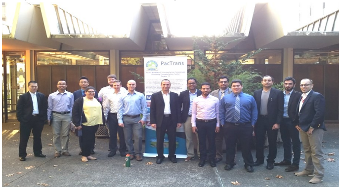
OSU student group on Day 1 at PacTrans