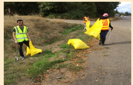
ITE members during Fall Clean-up