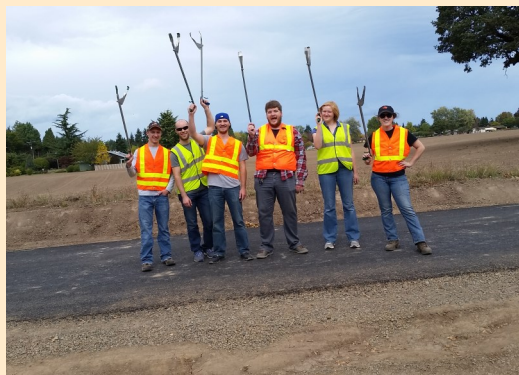
Portion of Clean-up crew upon completion

Over the summer came the announcement of the Chapter's involvement in a community service project. This term that was put into action! Members, officers, and the Chapter's faculty advisor all volunteered several hours of their time to make the inaugural event a huge success. In total, 15 people were on site to walk the two mile stretch of roadway and fill ODOT approved bags with a variety of findings. The portion of roadway is just past the Van Buren Bridge at NW Monroe Ave along Highway 34 to NE Colorado Lake Dr. Being that this was