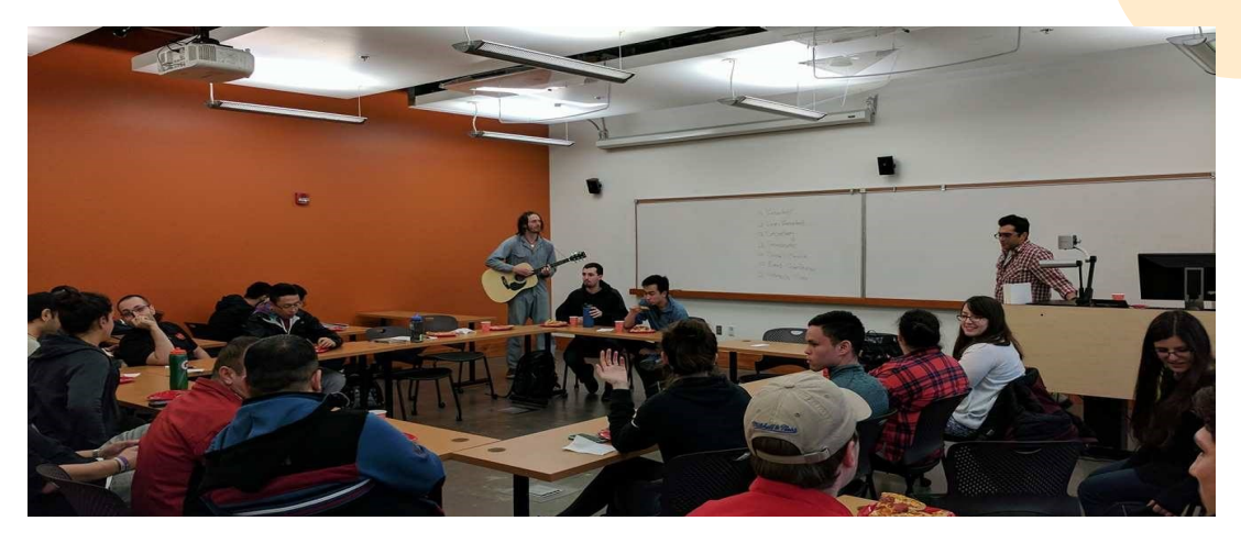
ITE Members are serenaded while voting in the election

We still have open chair positions, including leadership roles on the planning team for the 2018 Student Leadership Summit!